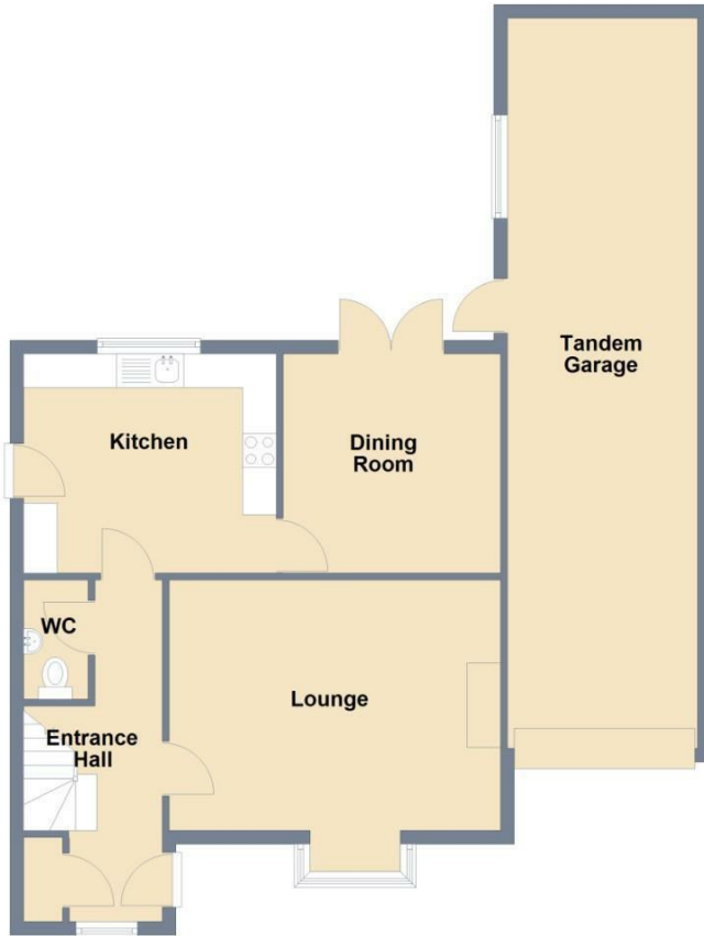
Ground Floor Approx. 84.8 sq. metres (913.3 sq. feet)