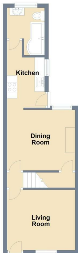
Ground Floor Approx. 34.2 sq. metres (368.0 sq. feet)