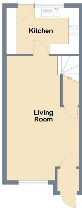
Ground Floor Approx. 30.2 sq. metres (325.4 sq. feet)