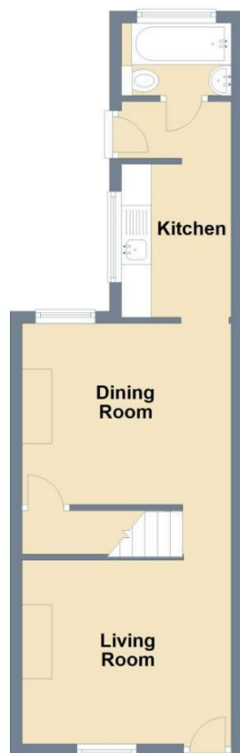
Ground Floor Approx. 34.3 sq. metres (369.2 sq. feet)