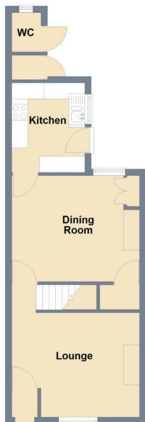
Ground Floor Approx. 38.6 sq. metres (415.5 sq. feet)