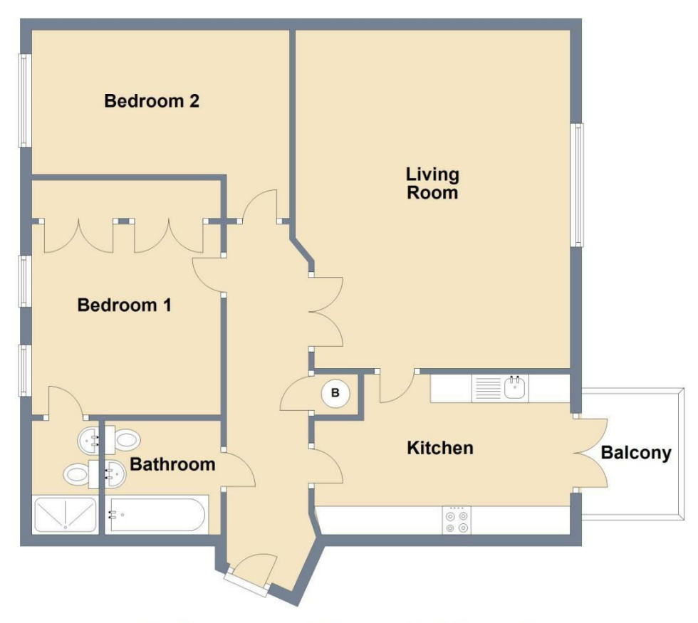
Total area: approx. 84.5 sq. metres (909.4 sq. feet)

Approx. 84.5 sq. metres (909.4 sq. feet)