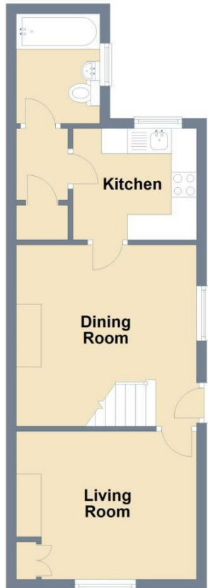
Ground Floor Approx. 36.1 sq. metres (388.5 sq. feet)