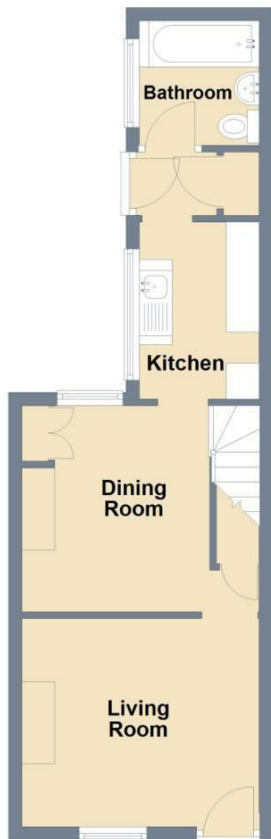
Ground Floor Approx. 33.8 sq. metres (364.3 sq. feet)