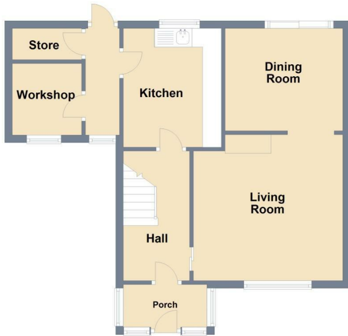
Ground Floor Approx. 50.8 sq. metres (546.5 sq. feet)