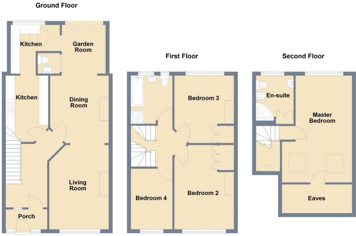
Total area: approx. 142.5 sq. metres (1533.6 sq. feet)