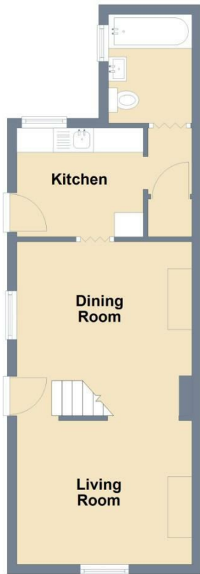
Ground Floor Approx. 36.5 sq. metres (393.0 sq. feet)