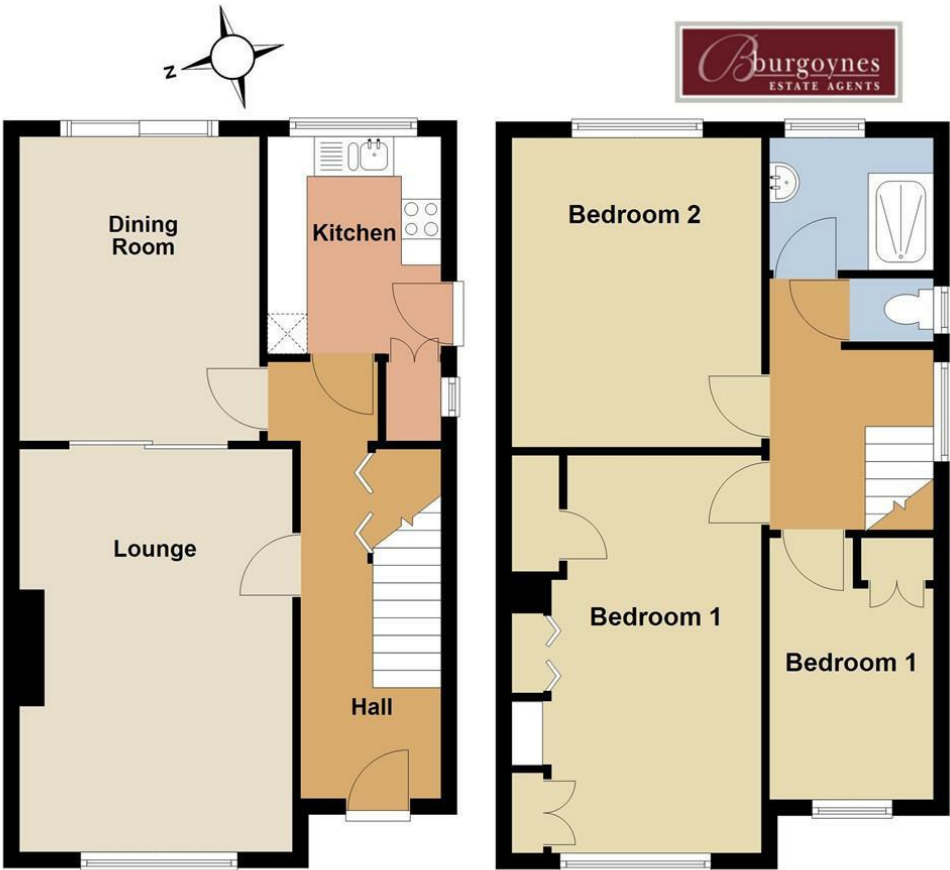
Ground Floor First Floor Total area: approx. 92.9 sq. metres (1000.3 sq. feet) Please note that whilst every attempt has been made to ensure the accuracy of this plan, all measurements are approximate and not to scale. This floor plan is for illustrative purposes only and no responsibility is accepted for any other use. 1 Linda Close, Exeter

These particulars, whilst believed to be accurate are set out as a general outline only for guidance and do not constitute any part of an offer or contract. Intending purchasers should not rely on them as statements of representation of fact, but must satisfy themselves by inspection or otherwise as to their accuracy. No person in this firms employment has the authority to make or give any representation or warranty in respect of the property.