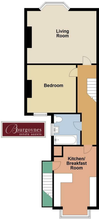
Total area: approx. 57.7 sq. metres (621.3 sq. feet) Please note that whilst every attempt has been made to ensure the accuracy of this plan, all measurements are approximate and not to scale. This floor plan is for illustrative purposes only and no responsibility is accepted for any other use.

These particulars, whilst believed to be accurate are set out as a general outline only for guidance and do not constitute any part of an offer or contract. Intending purchasers should not rely on them as statements of representation of fact, but must satisfy themselves by inspection or otherwise as to their accuracy. No person in this firms employment has the authority to make or give any representation or warranty in respect of the property.