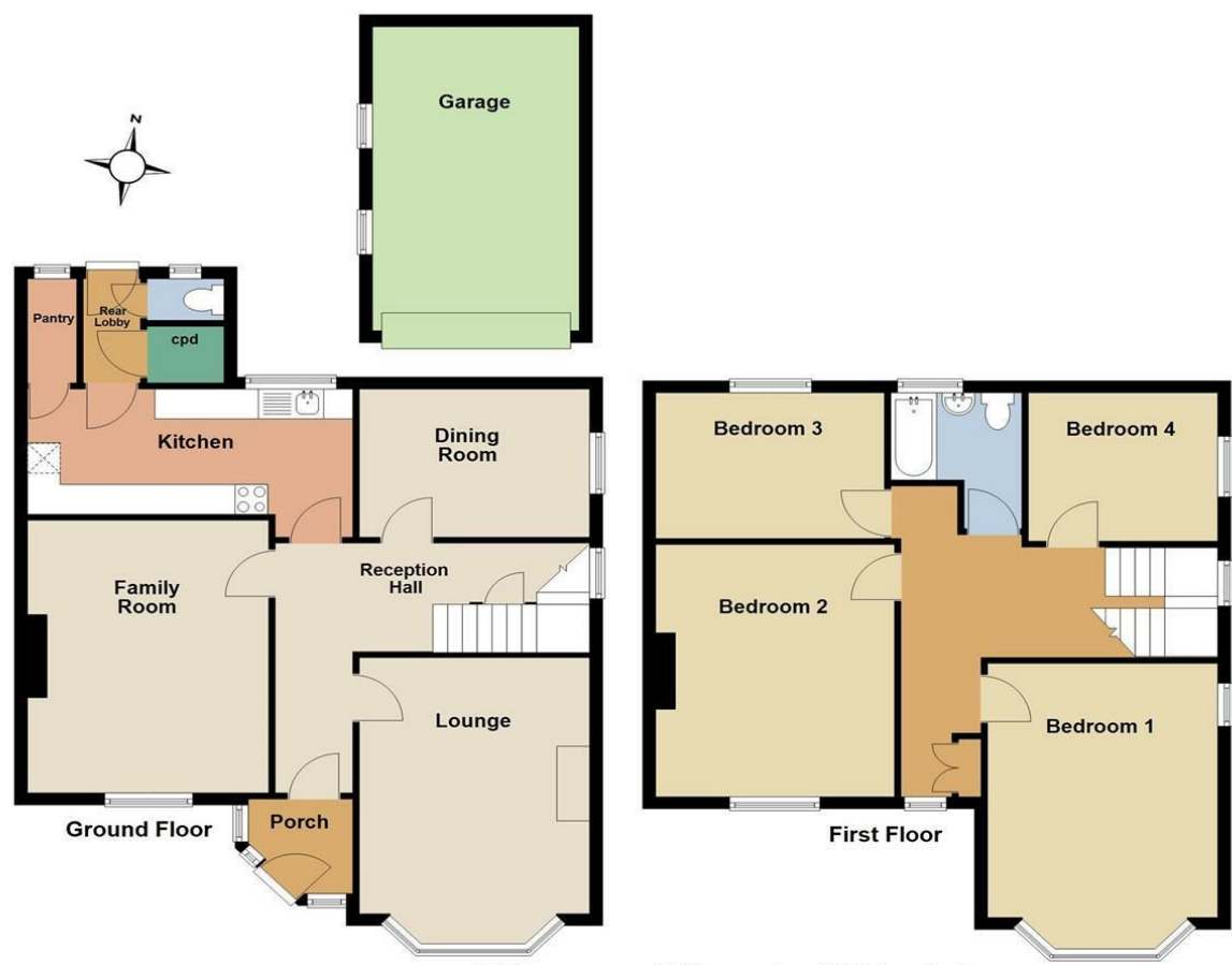
Total area: approx. 155.8 sq. metres (1677.1 sq. feet) Please note that whilst every attempt has been made to ensure the accuracy of this plan, all measurements are approximate and not to scale. This floor plan is for illustrative purposes only and no responsibility is accepted for any other use. 374 Pinhoe Road, Exeter

These particulars, whilst believed to be accurate are set out as a general outline only for guidance and do not constitute any part of an offer or contract. Intending purchasers should not rely on them as statements of representation of fact, but must satisfy themselves by inspection or otherwise as to their accuracy. No person in this firms employment has the authority to make or give any representation or warranty in respect of the property.