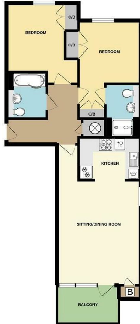
Measurements are approximate. Not to scale. Illustrative purposes only Made with Metropix ©2022