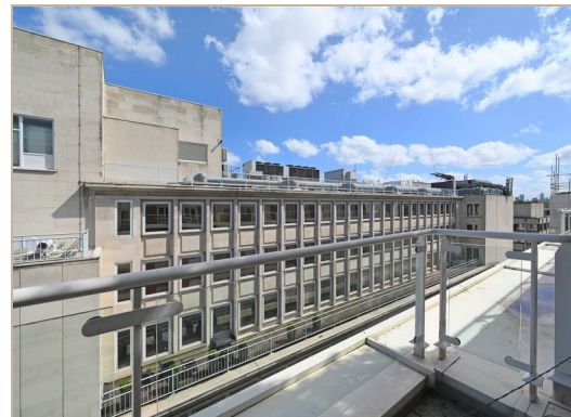
The Phoenix Approx. Gross Internal Area 1147 Sq Ft - 106.56 Sq M