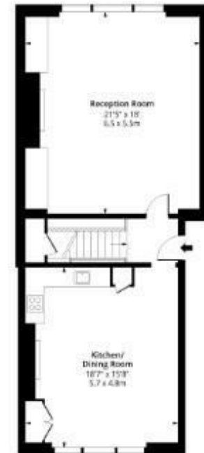
Ground Floor Floor Area 750 Sq Ft - 69.68 Sq M

IMPORTANT: We would inform prospective purchasers that these sales particulars have been prepared as a general guide only. A detailed survey has not been carried out, nor the services, appliances and fittings tested. Room sizes should not be relied upon for furnishing purposes and are approximate. If floor plans are included, they are for guidance only and illustration purposes only and may not be to scale. If there are any important matters likely to affect your decision to buy, please contact us before viewing the property.