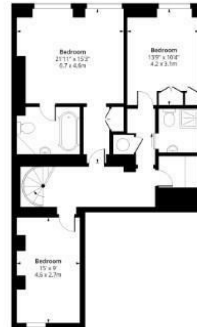
Lower Ground Floor Floor Area 862 Sq Ft - 80.08 Sq M