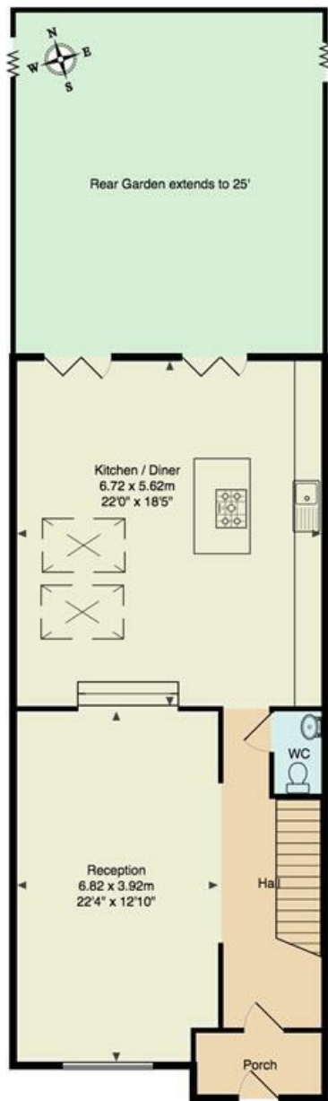
Ground Floor Area: 82.1 m 2 ... 884 ft 2