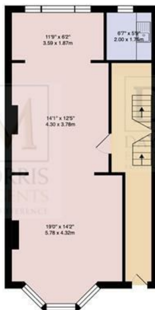
Raised Ground Floor