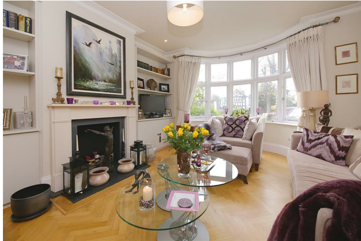
Reception Room 1 17'4" x 13'3" (5.30 x 4.06)