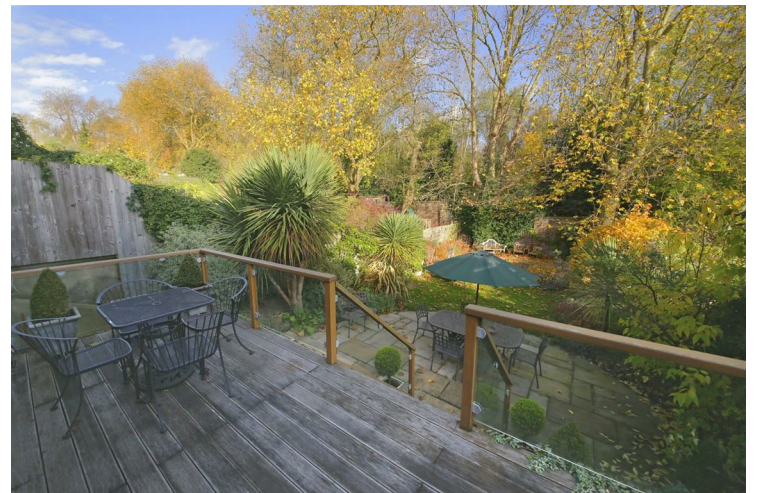
Garden 72'7" x 35'0" (22.13 x 10.69)