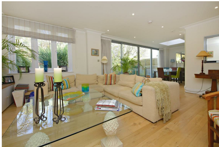
Reception Room 2 31'9" x 16'10" (9.70 x 5.15)