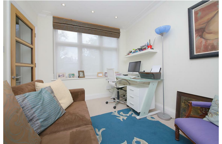
Study 11'1" x 8'11" (3.40 x 2.72)